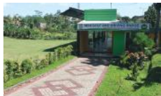
Mini Golf and Driving Range