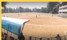
Football Field and Athletic Track