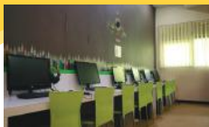
Self Access Center