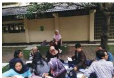
Student Area - Park