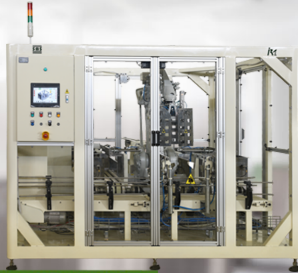
PACKAGING AUTOMATION ROBOT