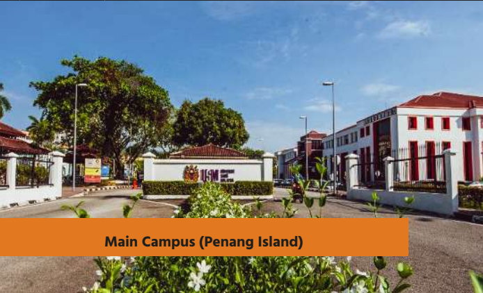
Main Campus (Penang Island)