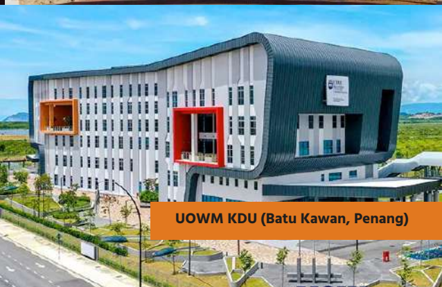
UOWM KDU (Batu Kawan, Penang)