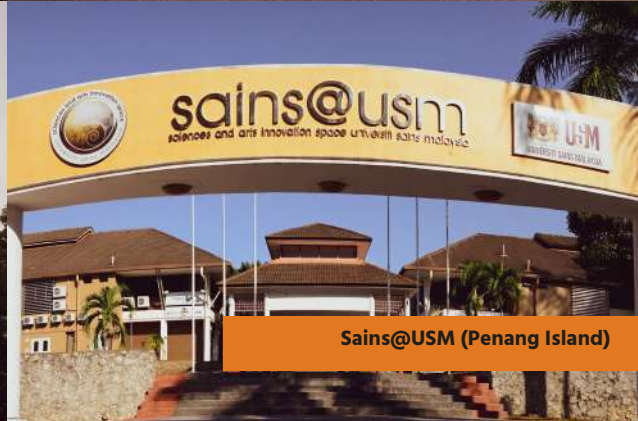
Sains@USM (Penang Island)