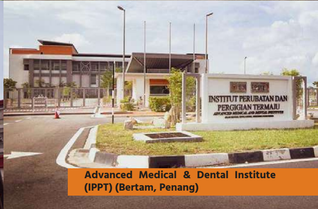
Advanced Medical & Dental Institute (IPPT) (Bertam, Penang)