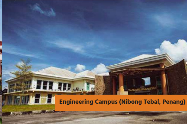
Engineering Campus (Nibong Tebal, Penang)