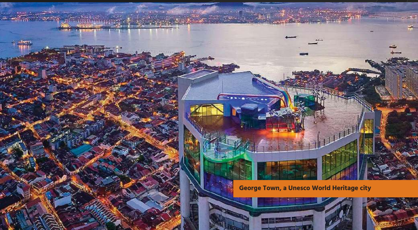
George Town, a Unesco World Heritage city