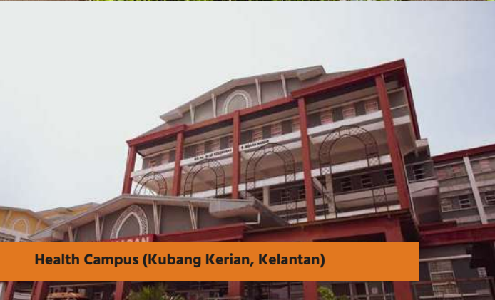
Health Campus (Kubang Kerian, Kelantan)